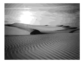
Image it's a hot, sunscorched day in the desert. Early that morning you started out on a short hike. But, now you are lost, and you've not had anything to drink all

day. Your tongue feels like sandpaper. Your lips are cracked. You've got a headache. All you can think about is a cool bottle of water. But, night comes, there is no rescue, and no water.