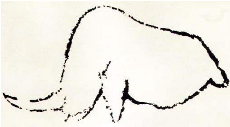
This paleolithic cave art (Rouffignac Cave, France) is thought to depict an elasmotherium.

We picture a unicorn as being a horse with a single horn. However, there is no evidence indicating that a unicorn was "horse-like," and the only indication of its physical shape in scripture is the Hebrew word "rame," meaning bull-like. Some say that the elasmotherium (pictured on the next page) is the animal referred to by the word "unicorn." This is an extinct giant rhinoceros whose fossils show that it had a single, very large horn. Scripture indicates unicorns were strong, solid animals, and this certainly was a strong animal.