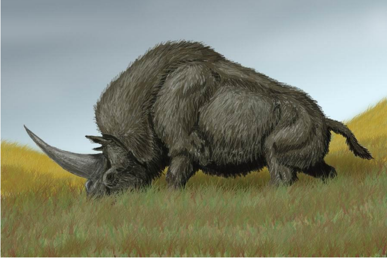
Artist rendition of what an elasmotherium might have looked like. Art by DiBgd, from Wikicommons. https://commons.wikimedia.org/wiki/File:Elasm062.jpg